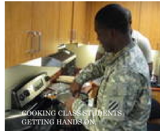
COOKING CLASS STUDENTS GETTING HANDS ON.