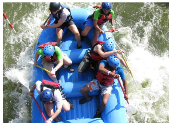
ROW-ROW-ROW your raft gently down the..... AHHHHHHH !!!!!