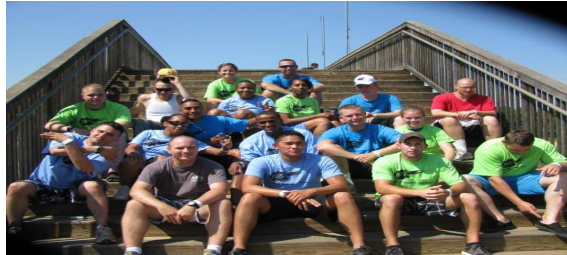
FT. STEWART AND FT. BRAGG BOSS STRONG!!

On 25 Sep 10 FSGA BOSS teamed up with Ft. Bragg BOSS program to get to know how our programs work and have a good time at the National Whitewater Center and the Carolina Panthers/ Cincinnati Bengals football Game. We had a great time and are looking forward to going again. The rapids were a bit unkind for a few Soldiers who took an unexpected swim but as fun as ever throughout the entire ride. The Bengals were too much for the Panthers to handle in the end too as T.O. and Chad Ochocinco teamed up to destroy the home team.